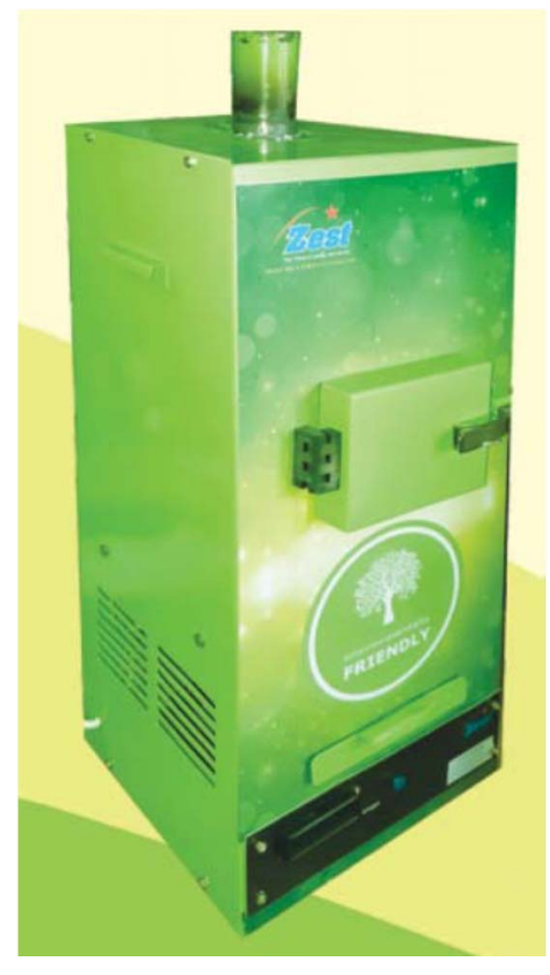
Sanitary Napkins & Dippers Incinerator