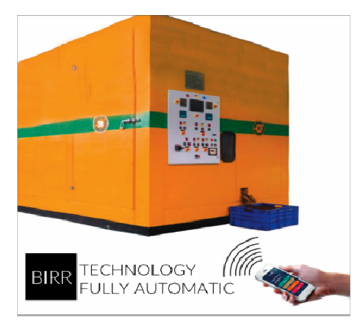
Mechanized Organic Waste Composter